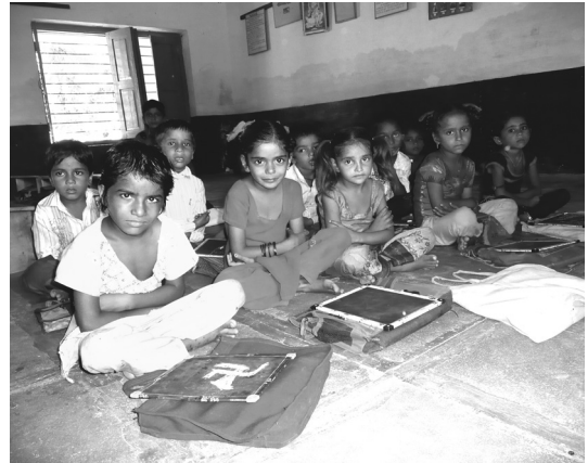
Fig. 5: Using education as a tool to rehabilitate poor and vulnerable children: public primary school in rural India, Anandpura, Gujarat/India

Grundschulbildung als Instrument der Eingliederung benachteiligter Kinder im ländlichen Indien, Anandpura, Gujarat