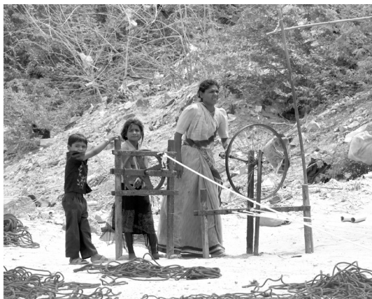
Fig. 6: Micro enterprises in the informal sector: rope production, Bhuj, Gujarat/India Mikrounternehmen im informellen Sektor: Produktion von Sisaltauen, Bhuj, Gujarat/Indien Micro-entreprises du secteur informel: production de cordes, Bhuj, Gujarat (Inde)

policy holders are finally forced to use the insurance funds not for replacing losses but for repaying immediate debt burdens. Insured households, in such situations, may not be better off in the event of damage than uninsured households, due to inefficient delivery channels, both governmental and non-governmental.