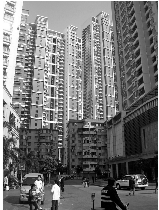
Fig. 3: Architectural contrasts and social disparities in urban China: Xiadu Urban Village in Guangzhou (in the foreground), modern urban riverside development (in the background)

Städtebauliche und soziale Gegensätze im Stadtbild: Xiadu «Urban Village» inmitten von Guangzhou (im Vordergrund), moderne Wohnanlage in Hochbauweise an der Uferpromenade (im Hintergrund)