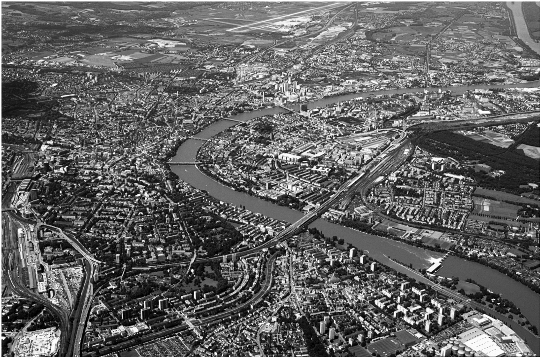
Fig. 4: Many studies at the University of Basel focus on regional economic and spatial development in the trilateral border region of Basel, Switzerland

Studienfokus auf regionaler Wirtschaftsentwicklung und Raumplanung im trinationalen Grenzraum Basel