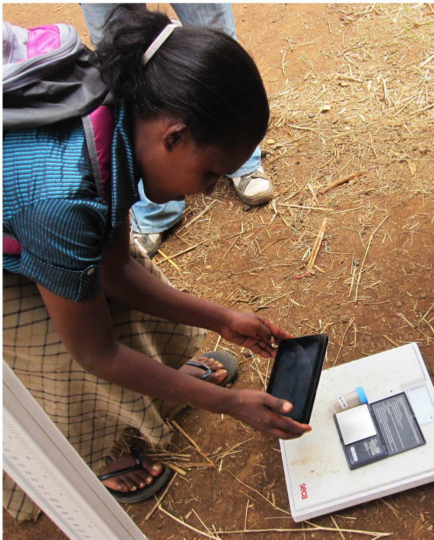
Figure 2. Capturing the identification number from a barcode-labeled stool specimen. As conducted during an integrated survey of neglected tropical diseases in Amhara National Regional state, Ethiopia in 2011. doi:10.1371/journal.pone.0074570.g002