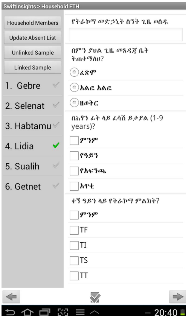
Figure 1. Example screen shot: looping fields for members grouped within a household record. As seen in a novel Android application for collecting data in household surveys. doi:10.1371/journal.pone.0074570.g001

The time taken to enter data when the survey was administered with tablets was 48 sec per person more on the first observed day (day 2) and 54 sec per person less on the second observed day (day 3) compared to paper surveys. These differences, however, were not statistically significant ( P = 0.20 and P = 0.50 , respectively).