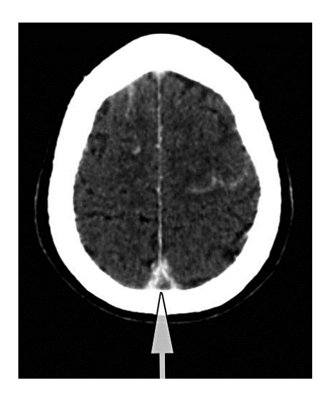
Fig. 3. Cerebral sinus venous thrombosis in the superior sagittal sinus, a subarachnoid hemorrhage in the right frontal region and the left precentral sulcus, with a hemorrhage in the right frontal lobe due to venous congestion.