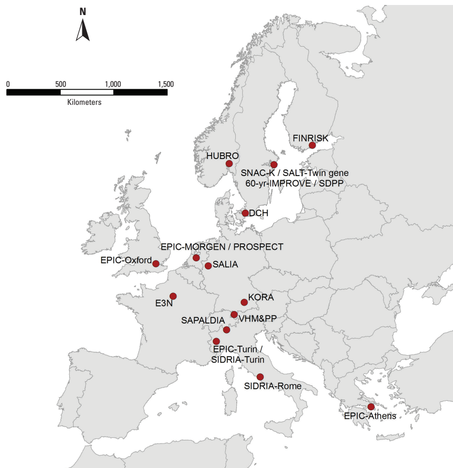
Figure 1. Cohort locations in which elements were measured.

Single-pollutant results. Positive HRs were estimated for almost all exposures, with a statistically significant association for