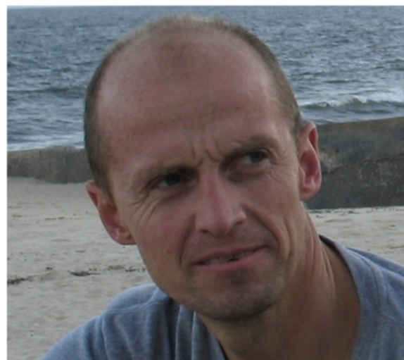
Fig. 8 Lorenz von Seidlein has worked for 20 years on malaria and other issues in global health. He worked in The Gambia on the first evaluations of ACTs in sub-Saharan Africa, and has managed several large vaccination projects. He is currently coordinating a major effort to eliminate malaria from areas with artemisinin resistance with the Mahidol Oxford Research unit in Bangkok, Thailand

The currently applied strategies towards malaria elimination mainly consist of vector control and case management. During the past century stringent implementation of these approaches has eliminated the disease in a number of countries ranging from Australia through the USA and reduced malaria to very low levels in many countries in Asia and Latin America [39]. As long as malaria therapy is efficacious and vector control measures work, continued and concerted efforts should slowly but steadily reduce further the burden of malaria. However, the current emergence of antimalarial and insecticidal resistance threatens to reverse these achievements in malaria control and increases the demand for interventions accelerating malaria elimination.