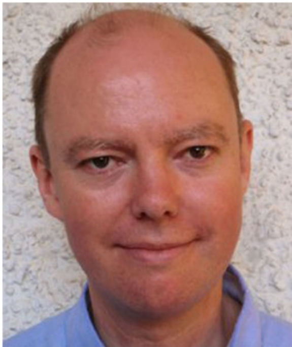
Fig. 3 Christopher JM Whitty is Professor of Public and International Health at the London School of Hygiene & Tropical Medicine (LSHTM), and Chief Scientific Advisor and Director of Research at the UK Department for International Development (DFID). He was previously director of the LSHTM Malaria Center and of the ACT Consortium

The debate around diagnosis for malaria elimination sometimes implies that the major issue is obtaining more sensitive diagnostic technology. Whilst improved