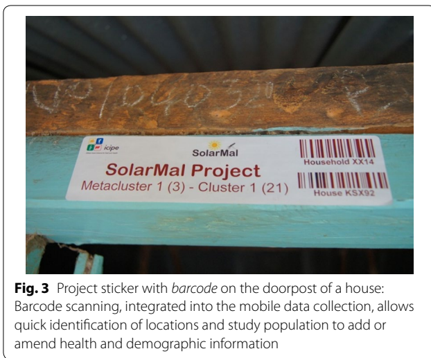
Fig. 3 Project sticker with barcode on the doorpost of a house: Barcode scanning, integrated into the mobile data collection, allows quick identification of locations and study population to add or amend health and demographic information

Upon arrival at a household the barcode is scanned and a digital log, which includes the interview date and time, is automatically created. After recording deaths and births, migrations into or out of the household are documented. There is a differentiation between migrations within the island and from elsewhere. Individuals moving within the island maintain their individual ID which becomes associated with the new household. These individuals found in the system by filtering on their previous village and their name, subsequently selecting and migrating him or her. Moving out of Rusinga puts the individual in an inactive state in the database;