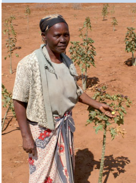
Figure 1: Kenyan farmer in Kibwezi showing her one year old jatropha plantation. Growth rate is low and carbon sequestration potential is limited.

Climate change mitigation is one of the key arguments for promoting biofuels. It has been claimed that cultivating jatropha increases the carbon stock when grown on marginal land, and additional GHG reductions are possible by replacing fossil diesel with biofuels. We have shown that bioenergy from jatropha can generate GHG savings of more than 40% compared with fossil fuels. However, jatropha can also create a carbon debt, delaying net savings for more than 50 years. The potential for climate change mitigation depends on where and how the value chain is established and is particularly sensitive to the initial soil and vegetation carbon stocks, land preparation, crop management and use of by-products.