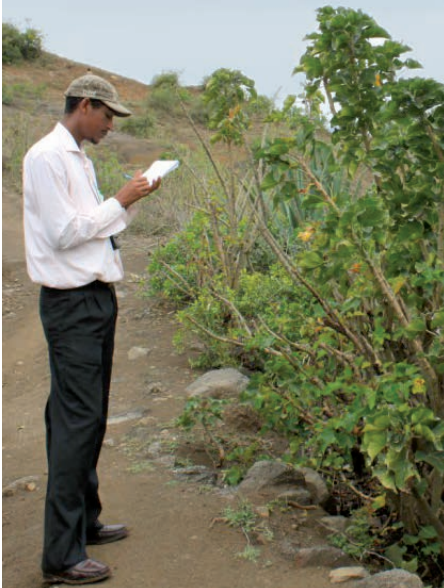
Figure 2: In Bati (Ethiopia) jatropha is used as fences around plots and as a soil and water conservation structure. The build-up of biomass and collection of seeds to secure local energy needs also allows for GHG savings.

Integrating jatropha into existing cropping systems as hedges or fences: In Tanzania, a private company linked jatropha out-growers to a centralized press. Jatropha is cultivated in fences, and the seeds are processed in a large-scale oil press, allowing maximum GHG savings due to low resource inputs during cultivation, minimal land use transformation and efficient co-product use. After ten years, however, the business is still not economically viable.