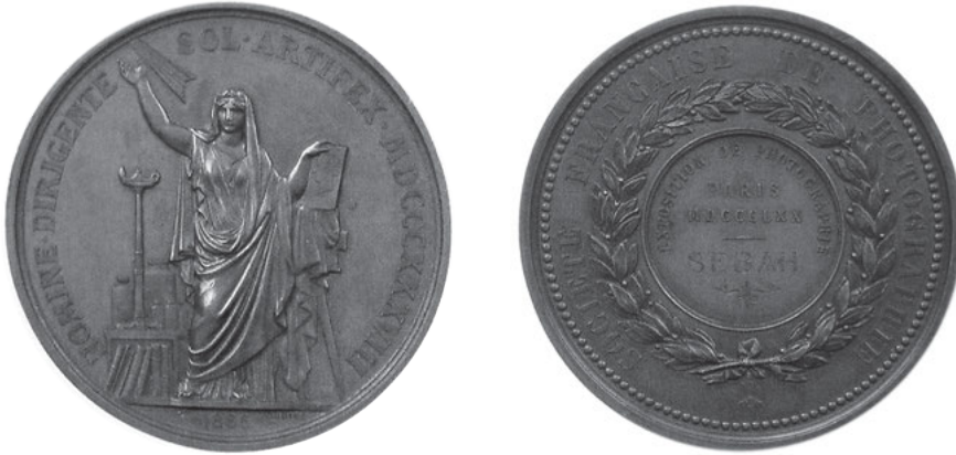
Fig. 6: Bronze medal of the Société française de photographie , engraved with the name Pascal Sebah, 1870, Paris, design: Eugène-André Oudiné, 1866, Pierre de Gigord Collection. Photomechanical reproduction from: Bahattin Öztuncay, The Photographers of Constantinople. Pioneers, Studios and Artists from 19th-Century Istanbul , Istanbul 2003, vol. 1, p. 266.

1869, was taken by Pascal Sebah (fig. 5). 33 All that appears on the back of the mount is the address of the studio in Latin letters, and an advertising slogan in Arabic with the usual rhetoric of early photographic studios. Other well-preserved and unequivocally dated calling card portraits of the 1860s by Sebah feature similar mounts.