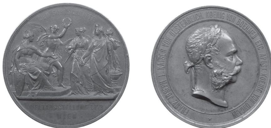
Fig. 7: Medal of Progress awarded at the Viennese World Fair of 1873, design: Josef Tautenhayn, c. 1873. Photomechanical reproduction from: Bahattin Öztuncay, The Photographers of Constantinople. Pioneers, Studios and Artists from 19th-Century Istanbul , Istanbul 2003, vol. 1, p. 268.

This finding permits us to raise justifiable doubts about the dating of the photo, hitherto considered accurate. Among other things, it poses the question as to why a mount dating from 1874 could have been used for a photo taken in 1868. Older mounts are known to have been used by such photo studios, including Sebah's, for photographs of later dates. However, we have never yet encountered the reverse instance, i.e. the use of a new mount for a photograph of an earlier date. Yet even if we were to assume that the subject of the photograph really is Benkovski – who, however, to judge from all of the findings gathered here could not have had himself photographed before 1874 – it would hardly make sense for him to have predated a portrait intended for a friend by six years. We must concede that there is no logical explanation for such an inscription. On the contrary, it is to be assumed that the photographic portrait of an anonymous and presumably well-educated young man only received its inscription at a later date as a means of awarding the unknown Ottoman intellectual on the photo the identity of the well-known Bulgarian revolutionary as desired and undisputed by Bulgarian historiography.