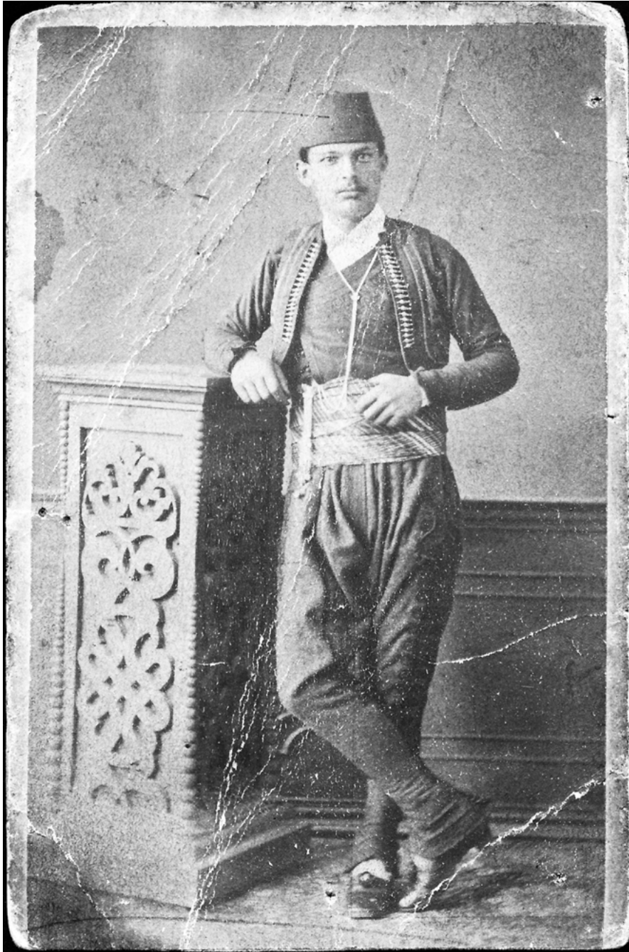
Fig. 2: Pascal Sebah: Anonymous photo portrait of an Ottoman intellectual . Albumen print, calling card format, front, Istanbul after 1874. Mounting board: 6.3 x 9.6 cm, photograph: 5.3 x 9.4 cm. Photo archive of the Cyril and Methodius National Library, Sofia, call no. C 507.