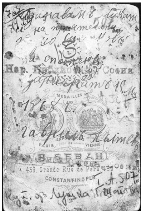
Fig. 3: Pascal Sebah: Anonymous photo prtrait of an Ottoman intellectual . Album print, calling card format, back, Istanbul after 1874. Mounting board: 6.3 × 9.6 cm. Photo archive of the Cyril and Methodius National Library, Sofia, call no. C 507.

Popov's article likewise contains information on the provenance, which – very probably taken from Jonkov's article – he presents as being absolutely certain.