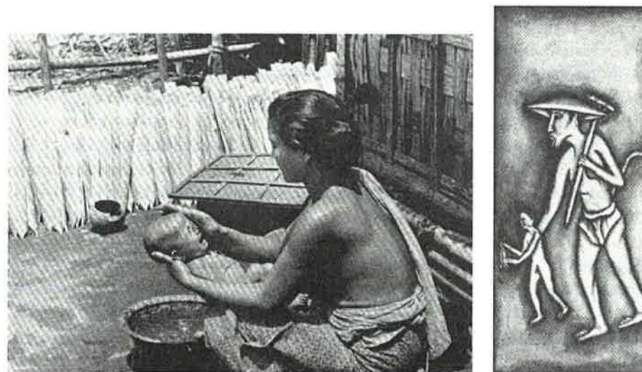
Figs. 3 and 4: Details of Plate 38 in Gregory Bateson and Margaret Mead, Balinese Character (1942).

Clearly, the case is different with Sapir and Mead. Their principal aim is not to stage a critique of the ethnographic construction of authority but to describe and evoke other cultures in poetry, ethnographic prose, and (in Mead's case) images. What connects the early-twentieth-century Boasians and the late-twentieth-century postmodern ethnographers though is their recourse to concepts current in the literary-critical circles of their time. Yet the transfer of literary forms and ideas to cultural anthropology has a very different political valence in these two moments in the history of anthropology. Literary scholars may feel a sense of pride that "their" terms have been adopted by major cultural anthropologists like Clifford, Marcus, and